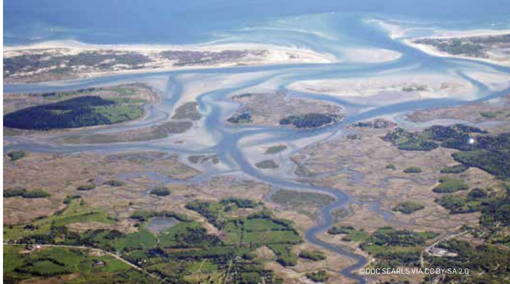
Left: Tidal flats on the Great Marsh like this one—near the Crane Wildlife Refuge’s Patterson Island on the Essex River Estuary—are favorites for clammers. Above: Much of the Essex portion of the Great Marsh is seen in this 2008 aerial photo. Choate Island in the Crane Wildlife Refuge can be seen in the upper left, with Castle Neck and Crane Beach beyond.

Upstream, hugging a grassy bank, stood a massive rock that would soon become a lifelong beacon—a place Pinciario would return to, over and over again, with his father to fish for stripers; a place that lured the boy with a mix of fear and delight. The water into which the pair waded with their rods was crawling with horseshoe crabs and Pinciario wore only sneakers.