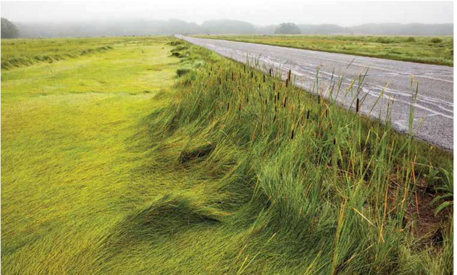
Above: Brilliant waves of green high marsh hay stand out against gray morning fog over Newman Road and Old Town Hill Reservation in Newbury. It is this high marsh habitat that is especially at risk from the effects of sea level rise. Below: Fox Creek winds its way through the Great Marsh, as seen from Argilla Road, just outside the entrance to Castle Hill on the Crane Estate in Ipswich.